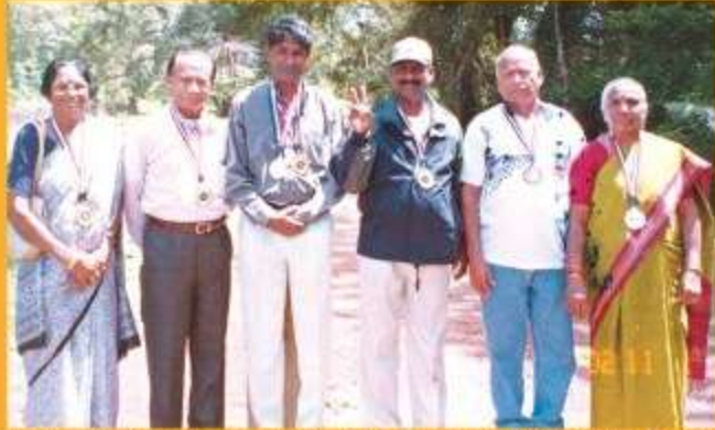
Sportn in 2002 Member from Andhra Pradesh Participated with Veteren