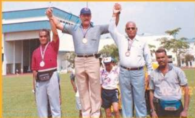
Author won Branze medal in shortput